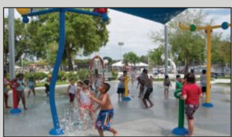
Westgate Splashpark, in West Palm Beach, is one of the county's interactive play areas.

For a complete list and map of county parks, call Parks & Recreation at 966-6600 or visit pbcgov.com/parks . Palm Beach County manages a wide variety of park properties including pools, beaches, water-parks, splashparks, recreation centers, tennis and pickleball courts, barrier-free play areas, amphitheaters, dog parks and campgrounds. The Parks & Recreation Department also offers summer camp.