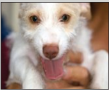
The county's main animal shelter is located at 7100 Belvedere Road, West Palm Beach.

Dogs and cats four months and older must have a rabies license tag purchased annually at Animal Care and Control (ACC), local veterinarians or at petdata.com . Tags can also be renewed at ACC or at petdata.com . Call 800-738-3463 for information or visit pbcgov.com/animal . Residents on public assistance may obtain free rabies vaccinations and tags for sterilized pets.