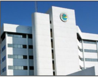
The central administrative office is located at 301 N. Olive Ave., West Palm Beach.

PBC TV Channel 20, and they are also streamed live on pbcgov.com/CH20 and social media. For the meeting schedule, visit pbcgov.com .