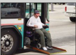
Buses are equipped with bicycle racks and can accommodate wheelchairs.

Palm Tran offers fixed-route bus service throughout Palm Beach County. For route information, call 841-4BUS (4287) or toll-free 877-930-4287. Information is also available at any county library and at palmtran.org . For information on Palm Tran CONNECTION (paratransit van service for seniors and riders with disabilities), call 649-9838 or toll-free 877-870-9849.